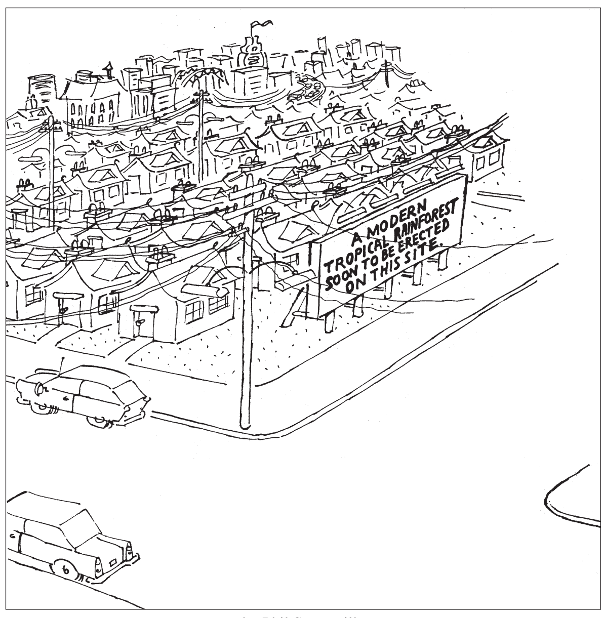
by Phil Somerville