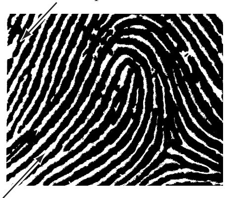
Valleys (indentations) in the fingerprint are recorded and processed as white.

Ridges in the fingerprint are recorded and processed as black.